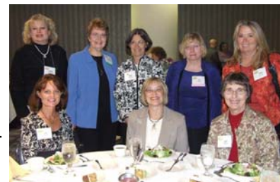
Way staff at the OLC luncheon.