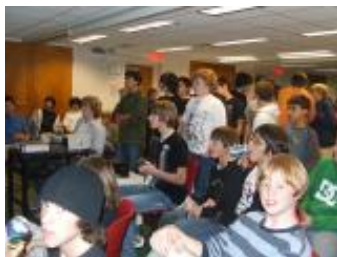
It was a full house at the library for Dance Dance Revolution October 12.

More than 90 young people enjoyed game night with EBGames on Friday, October 12. Another Dance Dance Revolution/Guitar Hero event is planned for Friday, November 2.