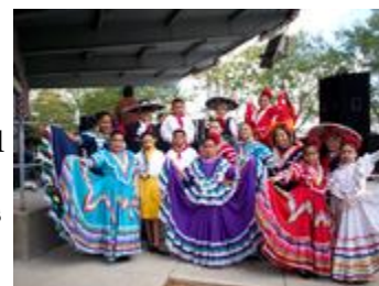
Folklorico Imagenes Mexicanas

On Sunday, November 4, from 2 to 3:30 p.m., Way Public Library, in conjunction with the Perrysburg Heights Community Association and the Perrysburg Area Arts Council, will present a program that explores the culture of Mexico. This family program is the second annual "Exploring Diversity" program.