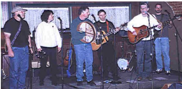
Our grand finale: Extra Stout will perform Friday, July 27, at 7 p.m.

Concert by Extra Stout —Friday, July 27, 7 p.m.