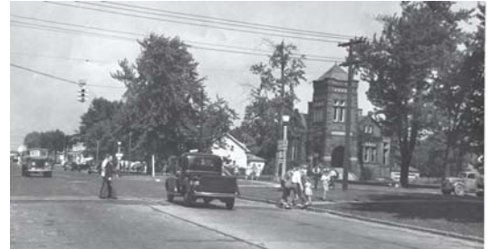
Above, the original Way Library, constructed in 1892, photographed c. 1939-1940. Below, an entry in the 1916 Centennial Parade honored the library and other notable "firsts" in city history.

Future editions of this newsletter will include news of this community party. Through this event we hope to show our appreciation to everyone for making the library such an important part of the community for 125 years!