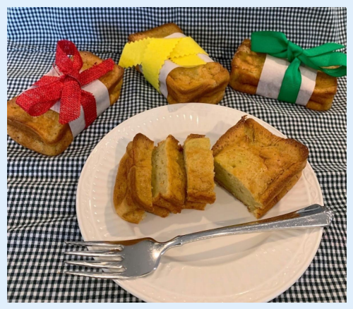
See all the pans in our collection.

Many of you probably have your own standard size loaf pan, perfect for making banana bread or meatloaf. Did you know that our Baker's Way cake pan collection includes two other sizes for you to try?