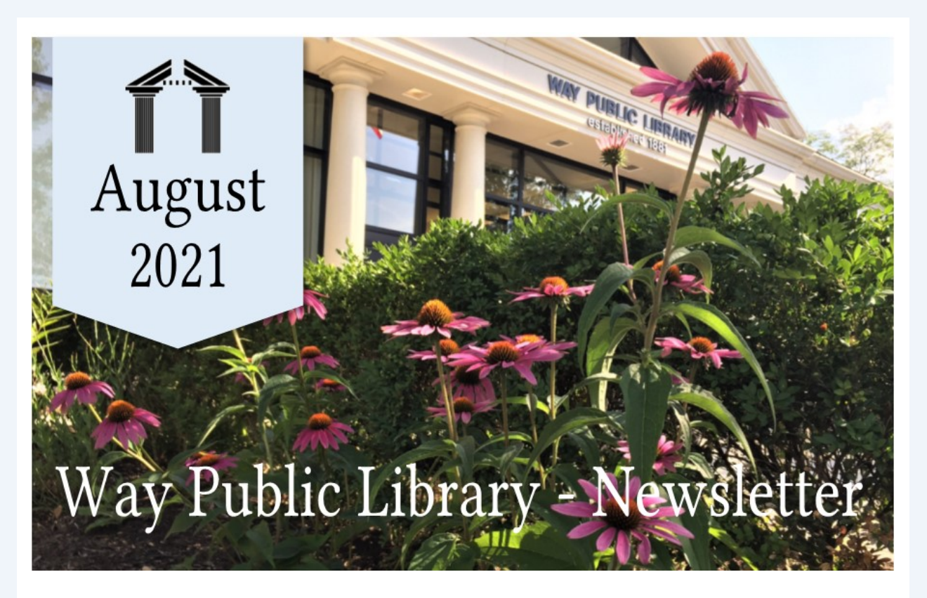
Visit our website