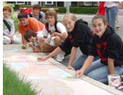
Chalk Walk artists