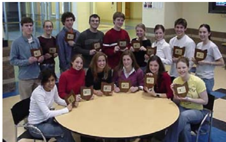
The PHS Speech Team: District Champions.

Way Library will host a special afternoon with the Perrysburg High School Speech Team on Sunday, March 6, beginning at 3 p.m. The dramatic and humorous interpretative competitors will follow up their trip to the state speech tournament on March 5 with a public performance the next day of their award-winning routines.