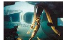
Port side of Fitzgerald's pilothouse, July 1994.