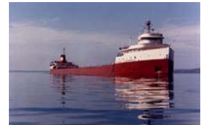
The Edmund Fitzgerald, St. Mary's River, 1975.

Historic Perrysburg, Inc., and Way Public Library are pleased to jointly present a commemoration program on the sinking of the Edmund Fitzgerald . This special event marking the 30th anniversary year of the Nov. 10, 1975, wreck will be held at the library on Wednesday, March 23 , at 7 p.m. This program is free and open to the public, but because of limited seating we are asking anyone who wishes to attend to register on our website: www.waylibrary.info , beginning March 7.