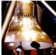
Restored Fitzgerald bell now in the Great Lakes Shipwreck Museum.