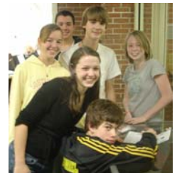
The after-hours Treasure Hunt on Nov. 11 was a big hit. Above, the winners.

Last year in January, the library lifted the gloom of winter with "LOL at the Library." This year, it's Snow Ball. Join us in January!