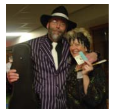
Cast, crew and hundreds of volunteers contributed to the third annual interactive mystery play.